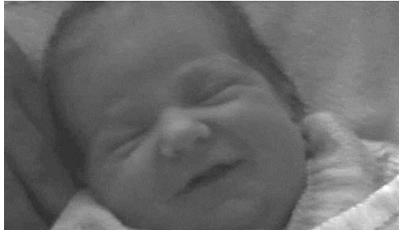
Fig. 2 Smile of a 42-hour-old sleeping infant. Typical Duchenne smile with cheek raising which is thought to relate to the experience of positive emotion (see main text). Reproduced from Messinger et al. (2002) with permission

contribution of sleep structure and NREM sleep (quiet sleep in newborns) to these important functions. Indeed, a recent study tested whether sleep–wake transitions in the neonatal period might predict emotional and cognitive development in premature infants during the first 5 years of life (Weisman et al. 2011). Sleep states at a gestational age of 37 weeks, emotional regulation during infant–mother and infant–father interactions at 3 and 6 months, cognitive development at 6, 12, and 24 months, as well as verbal IQ, executive functions, and symbolic competence at 5 years were assessed. It was shown that sleep-state transitions characterized by shifts between quiet sleep and wakefulness (contrary to rapid cycles between states of high arousal, such as active sleep and cry) are important for an optimal emotional and cognitive development, at least in premature infants.