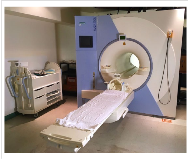
Figure 1. Decommissioned Siemens 1.5T MRI used for the neurosuggestion procedure.